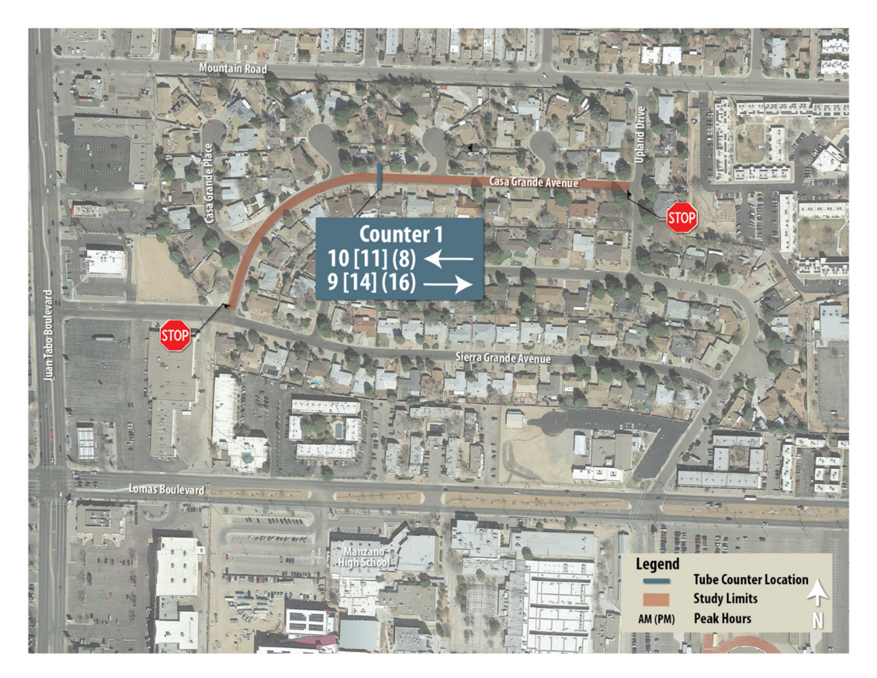
Figure 1: Project Area and Existing Traffic Volumes

The Casa Grande Avenue project is located in Albuquerque, New Mexico and is approximately 0.29 miles (1535 feet) in length. Casa Grande Avenue is a two-lane, undivided local street that runs north-south from Sierra Grande Avenue at the west end, and curves at Casa Grande Place to run east-west to Upland Drive. Sierra Grande Avenue is a two-lane, undivided local street that runs east-west and intersects the west end of Casa Grande Avenue at a T-intersection. Upland Drive is two-lane, undivided local street that runs north-south and intersects the east end of Casa Grande Avenue at a T-intersection. See Figure 1 for a map of the project area.