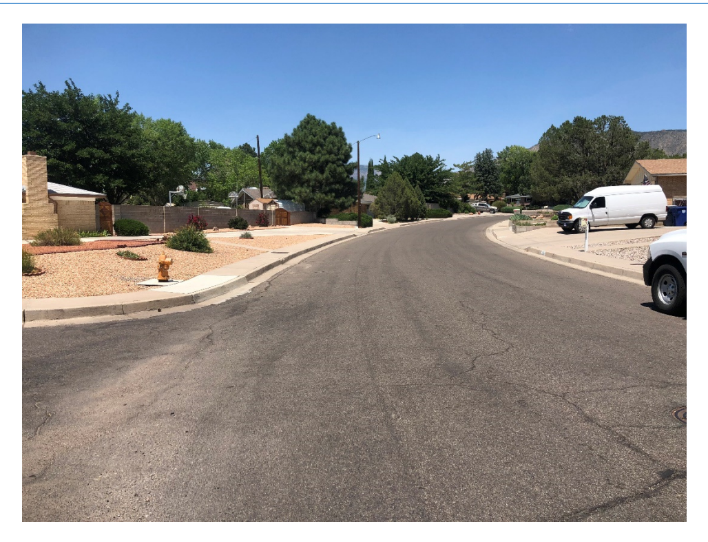
Figure 3: Casa Grande Avenue looking east