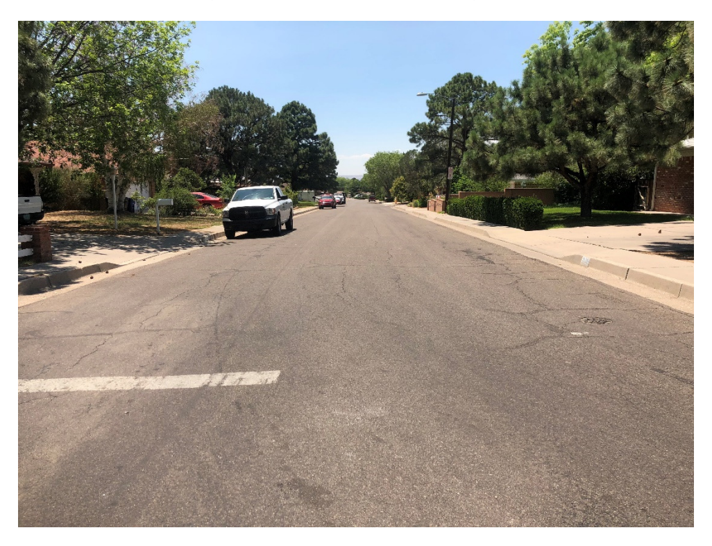
Figure 4: Casa Grande Avenue looking west